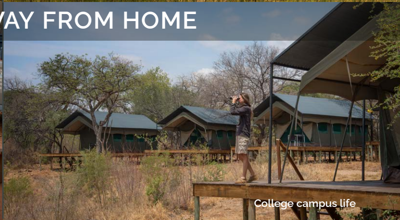
College campus life